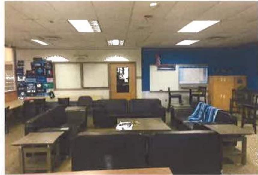
Student Innovation Center